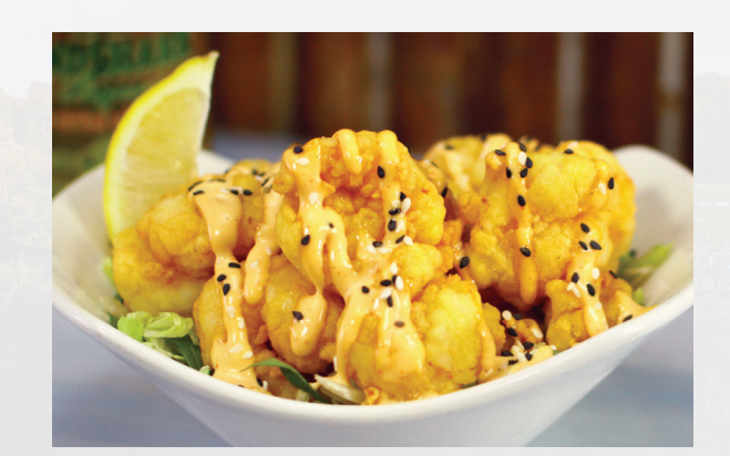
LAVA LAVA SHRIMP Golden fried shrimp drizzled with our chili lime aioli $19.99

One pound of wings tossed in your choice of Buffalo or Jerk sauce. Served with carrot & celery sticks and ranch or blue cheese $22.99